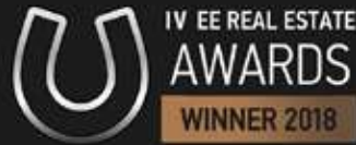
COMMERTIAL INTERIOR OF THE YEAR